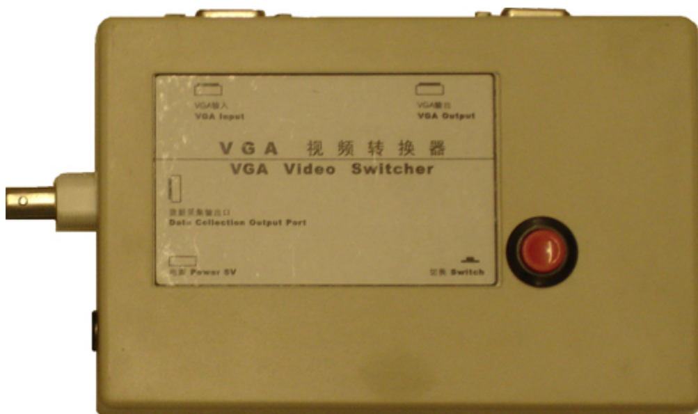
Figure 1. Picture of a video switcher. It has VGA input and output ports (both female), a button to switch between two display modes, and a trigger output port.