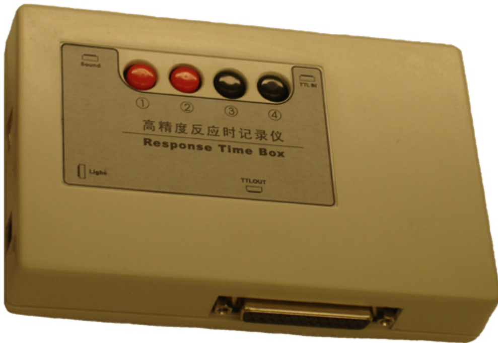
Figure 4. Picture of an RTbox. It has a USB-B port, a light input port, a pulse/sound input port, an external button input port, and a TTL output port.